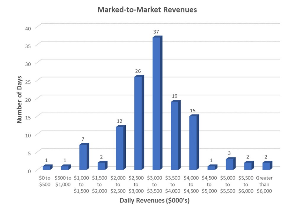
In our Securities market-making and trading activities, we maintain inventories of equity and debt securities. In our Physical Commodities segment, our positions include physical inventories, forwards, futures and options on futures, and OTC derivatives. Our commodity trading activities are managed as one consolidated book for each commodity encompassing both cash positions and derivative instruments. We monitor the aggregate position for each commodity in equivalent physical ounces, metric tons or other relevant unit.

Management believes that the volatility of revenues is a key indicator of the effectiveness of our risk management techniques. The graph below summarizes volatility of our daily revenue, determined on a marked-to-market basis, during the six months ended March 31, 2019.